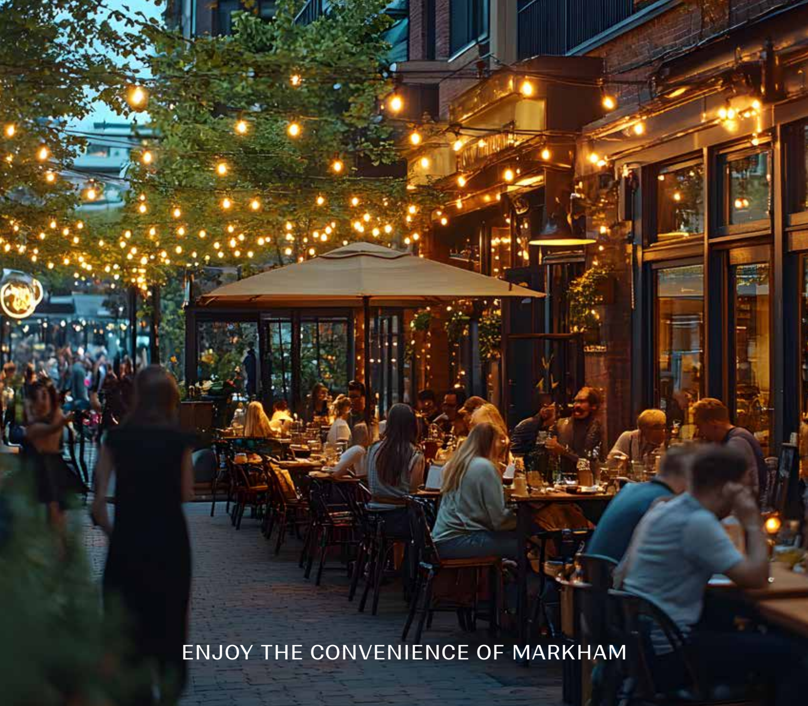
ENJOY THE CONVENIENCE OF MARKHAM