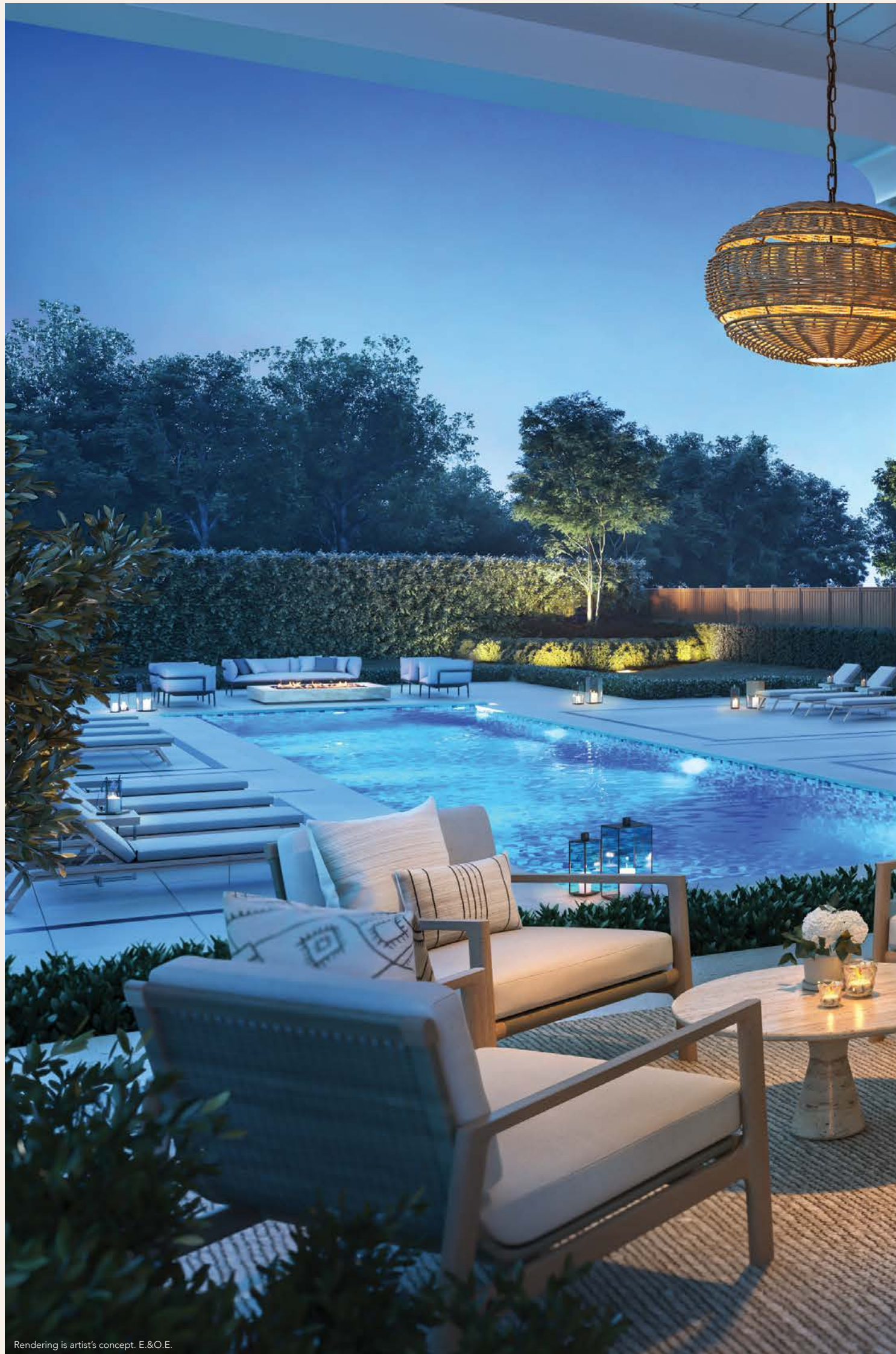
Rendering is artist's concept. E.&O.E.