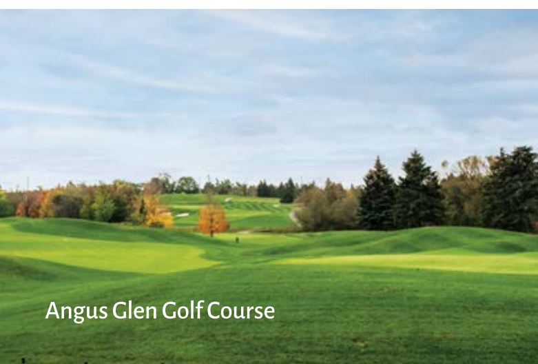
Angus Glen Golf Course